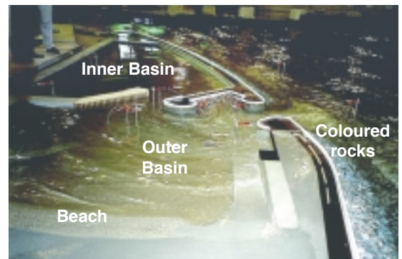
Simulated easterly gale conditions showing wave energy being absorbed in outer basin while leaving inner basin calm